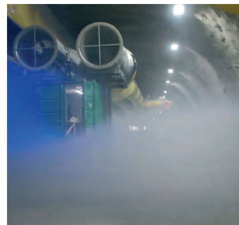
Alptransit, lotto Sigirino 2011

The formation of a blanket of fog makes it possible to take effective measures against dust, to control and lower gaseous vapours and to cool off the environment, thus creating a damp, but not muddy layer that stops dust from rising again.