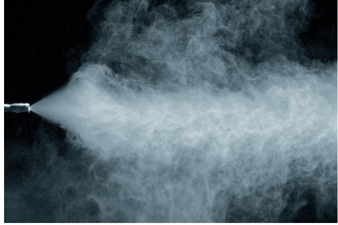
Nebulising nozzle detail